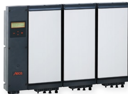
StecaGrid 1900 D Master and 2 StecaGrid 1900 Slaves