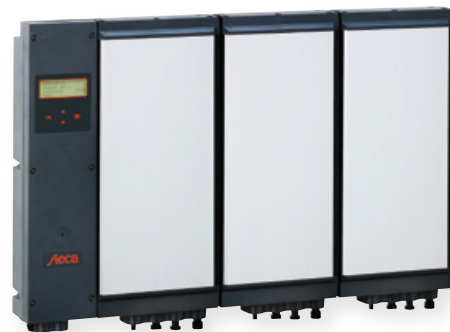
StecaGrid 2000+ Master and 2 StecaGrid 2000+ Slaves