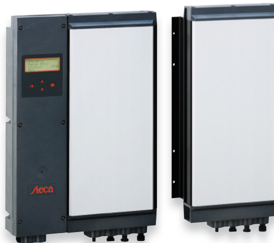
StecaGrid 2000+ Master